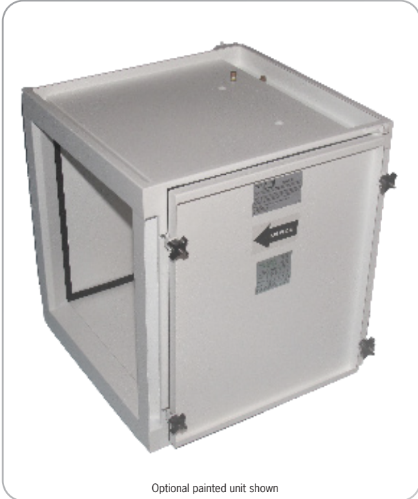
Optional painted unit shown